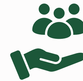
Service to Society

Maintenance and restoration of natural ecosystem is essential to sustain community wellbeing, economic prosperity and efficiency. Social responsibility brings people together and promotes respect for others.